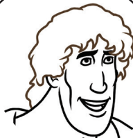
Saul Lessons 10 & 11