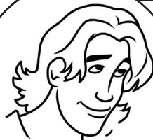
David Lesson 12