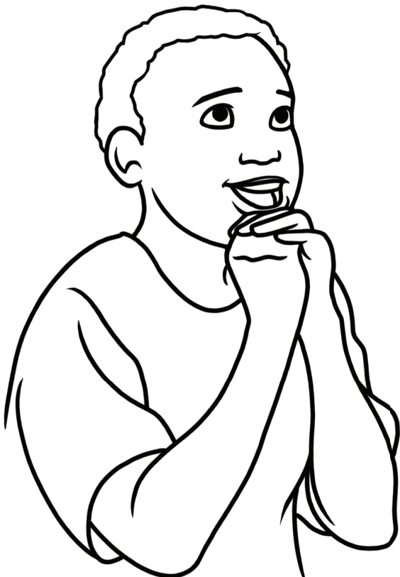
Psalm of Thanksgiving