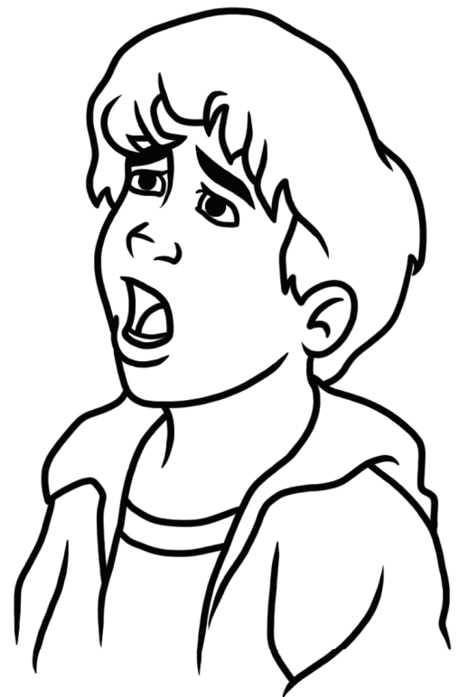
Psalm of Lament

Print and cut out one set of cards for each team or for each student, depending on how you play.