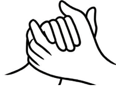
Helped the people