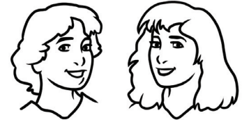
Children of Judah