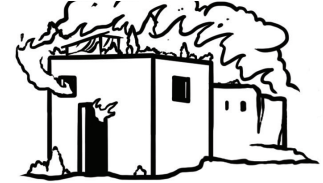
Destroyed the land