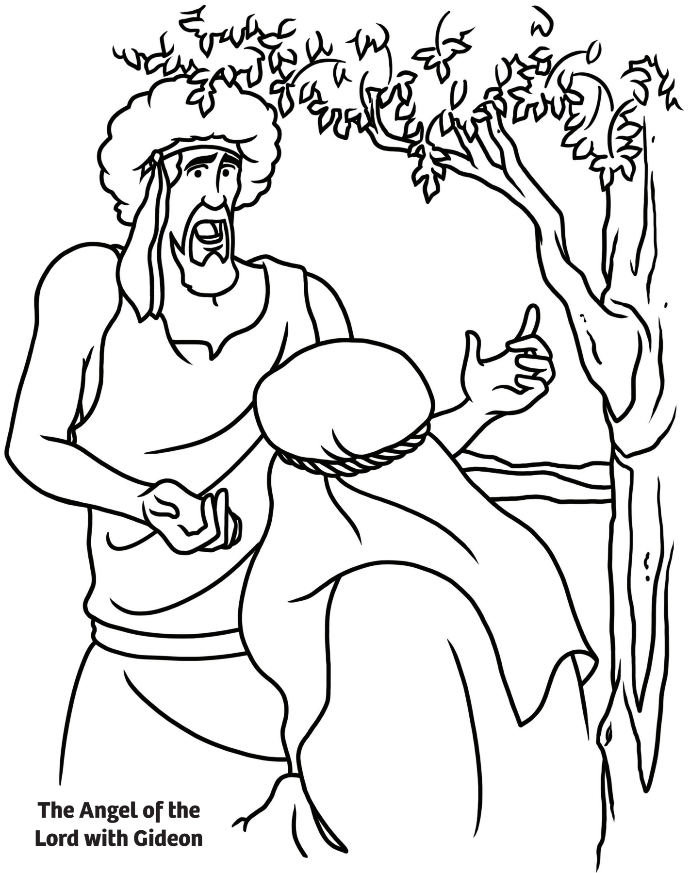
The Angel of the Lord with Gideon

Print one copy of each illustration for your use.